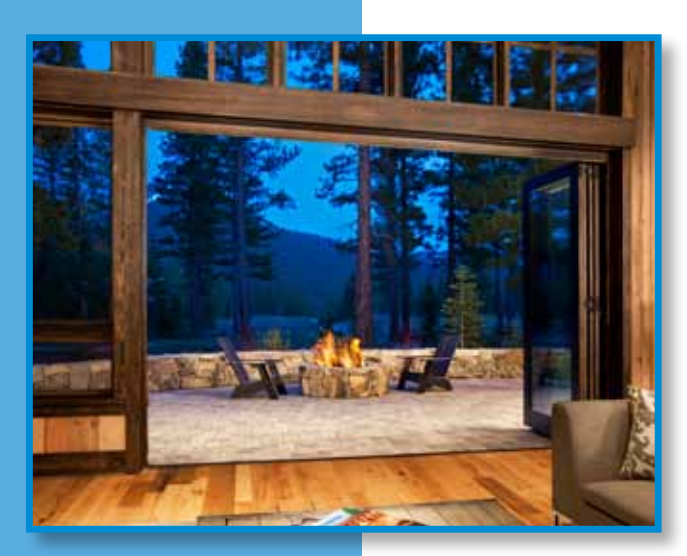
Project by Mark Tanner Construction.

Sierra Pacific Bi-fold Windows and Doors glide smoothly to create large openings that transform your living spaces. With panels folding and stacking either to one or both sides of an opening, our Bi-fold products are both functional and aesthetically pleasing. The minimal panel stack widths further enhance the clear opening space.